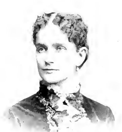
IDA SAXTON MCKINLEY.

been unfitted for active participation in the social enjoyments which Washington life affords, she has been in the highest sense of the word a happy woman, in a more than ordinarily happy married